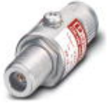
Attachment plug with replaceable surge protection for coaxial signal interfaces. Connection: N connector plug/socket

Surge protection device - CN-UB-280DC-SB - 2818148