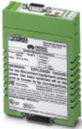
Wireless transceiver (transmitter and receiver) with RS-232 interface, for 900 MHz ISM band (America)

Please be informed that the data shown in this PDF Document is generated from our Online Catalog. Please find the complete data in the user's documentation. Our General Terms of Use for Downloads are valid ( http://phoenixcontact.com/download )